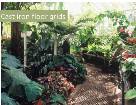
Cast iron floor grids