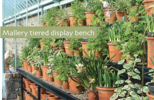
Mallery tiered display bench

This display bench comprises two or three well spaced, strong shelves supported on long, elegant legs - creating stunning plant displays. It also enables areas with lower light levels at the back of a greenhouse to be fully utilised.