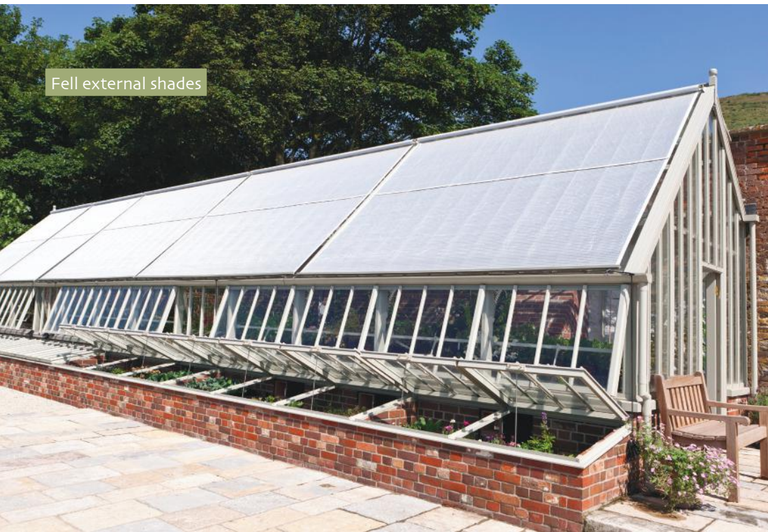
Fell external shades