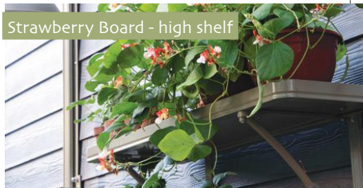
Strawberry Board - high shelf

The closer the plant and foliage to the glass, the more impact is to be gained from the sun's rays – particularly in times of lower light levels. Mounted on the eaves, along the gable or high on the rear wall, strawberry boards add valuable extra space in the busy growing season.