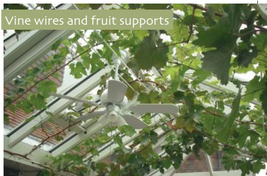
Vine wires and fruit supports

Bespoke fruit supports and vine wires offer structure and support to peaches, vines, melons, tomatoes and cucumbers to name a few. We will work out your growing needs and the areas where you want to train fruit, and combine rigid supports with tensioned wires to train plants up to the roof space and, in a lean-to greenhouse, up and across the rear wall.