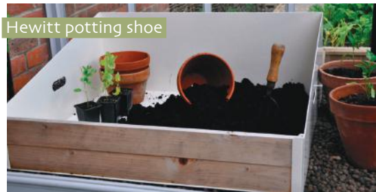
Hewitt potting shoe

A favourite of the professional gardener, this stoutly constructed potting shoe sits perfectly on our traditional bench. It is designed to enable the fast and efficient filling of pots, allowing the compost to be kept in a manageable area.