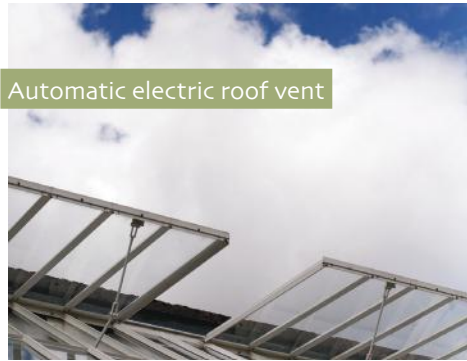
Automatic electric roof vent