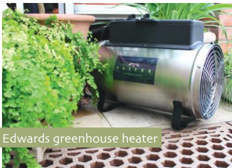
Edwards greenhouse heater

Our shades are recommended to optimise heat and light level control. Fitted externally between the glasshouse ridge and gutter, the shade reduces light intensity and therefore plant scorch, and helps to keep temperatures down.